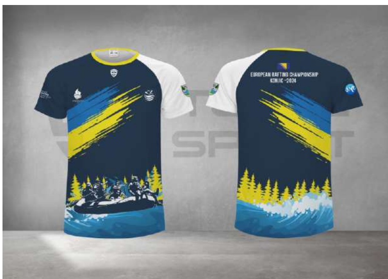
Official jersey of the European Rafting Championship 2024.