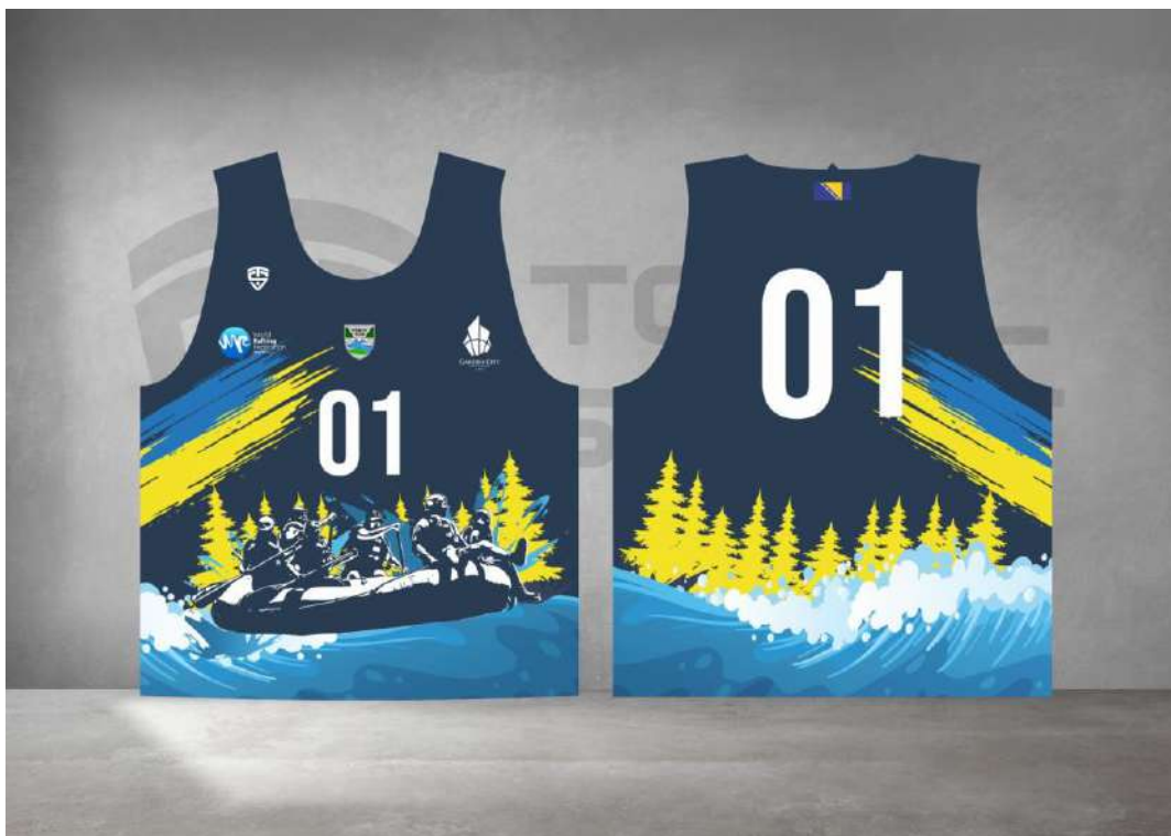
Official vest for the downhill and slalom races.

Important: National flags, other flags, propaganda, or messages are not allowed on the podium.