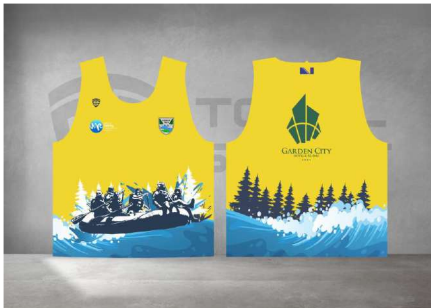
Official marker for the RX race - yellow.