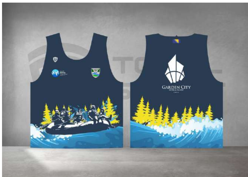
Official marker for the RX race - blue.